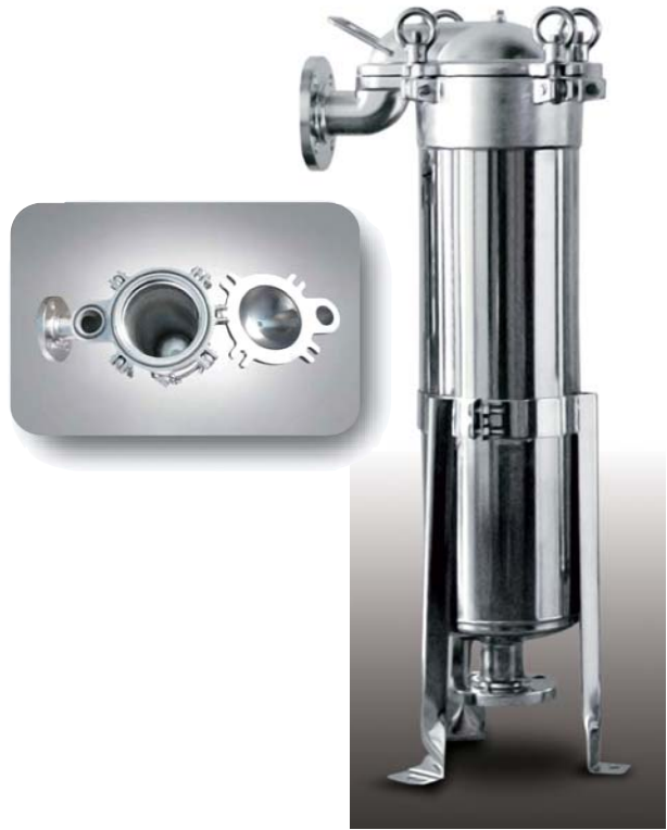
Electro-Polished Nowata TNB Top Entry, Single Bag Filter Housing with ANSI Flanged Inlet and Outlet